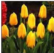
Figure 4. Candela