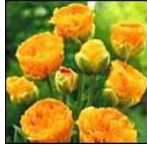
Figure 2. Beauty of Apeldoorn