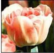
Figure 1. Angelique

Tulips are classified with perennials but often need to be treated as annuals. Dig up your tulip bulbs once the foliage has died & store them in a cool dry area for replanting in the fall. There are a wide variety of tulips, some are shown in the following figures.