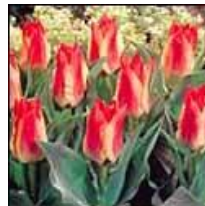
Figure 5. Plaisir

Order your bulbs early enough that they can spend anywhere from 8 to 10 weeks basking in the chill of your frig. Store them in a mesh bag so that they get good air circulation. If you are a fruit lover you may want to strongly consider getting a spare refrigerator – one of the minis so readily available. Fruit gives off ethylene gas – and ethylene gas will kill the flower inside your bulbs.