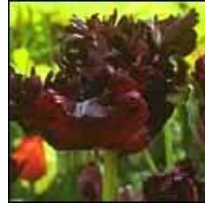
Figure 3. Black Parrot